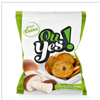
Baked bread snacks

Product group Cereals and cereal preparations Product subgroup Pastrycooks' products Product code 1905 40 10 Product line OU YES