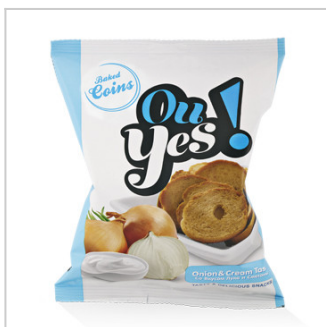
Baked bread snacks

Product group Cereals and cereal preparations Product subgroup Pastrycooks' products Product code 1905 40 10 Product line OU YES