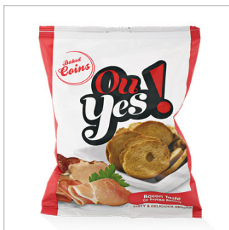
Baked bread snacks

Product group Cereals and cereal preparations Product subgroup Pastrycooks' products Product code 1905 40 10 Product line OU YES