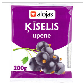
Gelatin dessert with blackberry flavor.

Product group Condiments Product subgroup Other Product code 3503 00 10 Product line