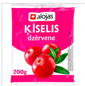
Gelatin dessert with cranberry flavor.

Product group Condiments Product subgroup Other Product code 3503 00 10 Product line